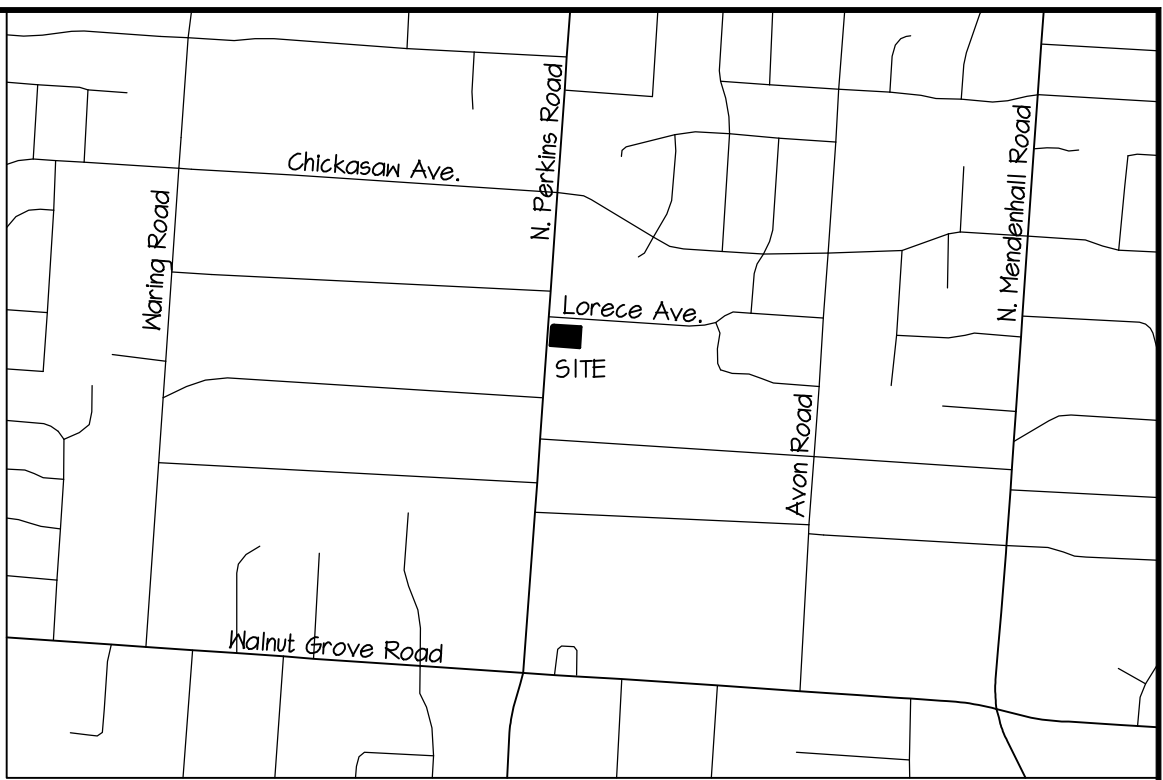
Vicinity Map nts

Rad = 15.00' Arc = 23.56' Tan = 15.00' Chd = 21.21' N48°42'40"E Del = 90°00'00"